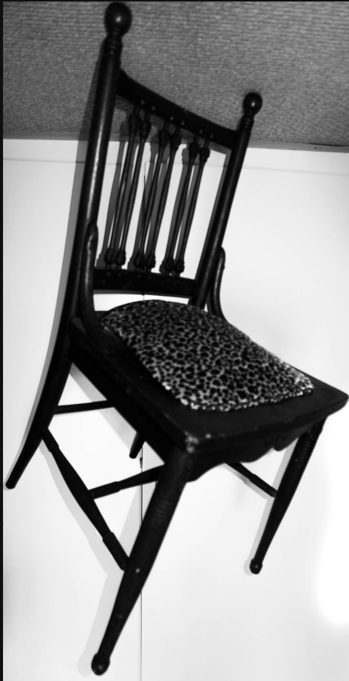
Take a Rest